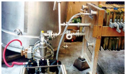
High Flow & Pressure 3:1 Lees Filter Press Charging