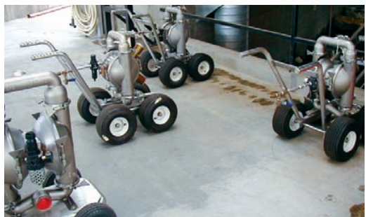
Must handling and other multi-use applications

Also: Barrel Wash Lees Recovery, Filling, Chemical Dosing, Effluent and Sump Applications