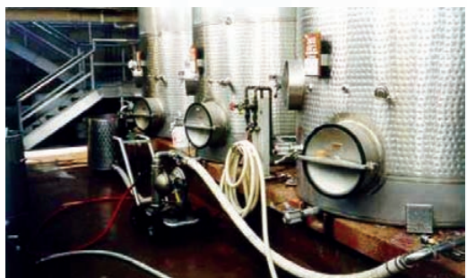
Pump Over Process