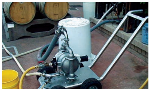
Barrel Topping or Pump Out for Blending